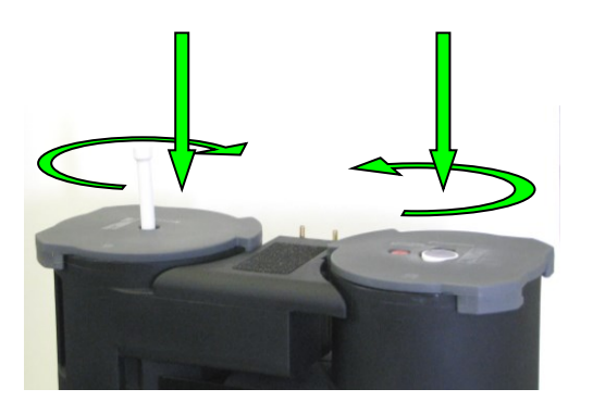
Make sure both lids are placed and secured properly.