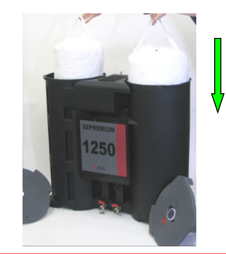
14. Your SEPREMIUM 1250 is ready for operation.

12. When both towers are filled with water and the black element rests on the bottom of tower 2 you can replace both white elements. White indicator element in tower 1 and static white element in tower 2.