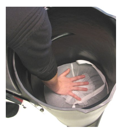
Push the element down until all the trapped air has escaped out of the carbon element.

11. Make sure the black element rests on the bottom of the tower by pushing it down.